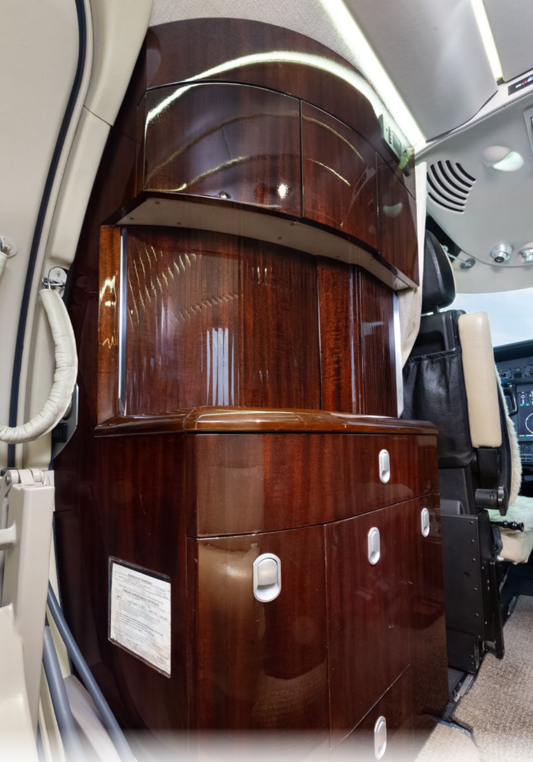
2016 CITATION CJ4 SERIAL NUMBER 525C-0222